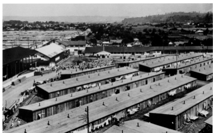
Puyallup Assembly Center