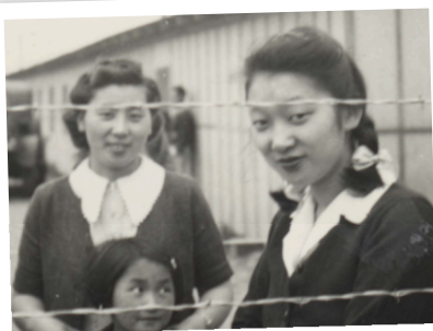
Imprisoned without a crime

Did you know the Puyallup Fairgrounds was used as a temporary American Concentration Camp in 1942?